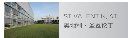
ST.VALENTIN, AT 奥地利·圣瓦伦丁