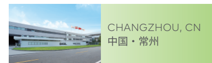
CHANGZHOU, CN 中国·常州