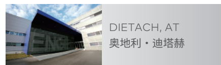
DIETACH, AT 奥地利·迪塔赫