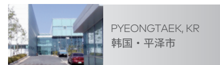
PYEONGTAEK, KR 韩国·平泽市