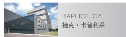
KAPLICE, CZ 捷克·卡普利采