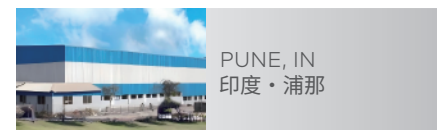
PUNE, IN 印度·浦那