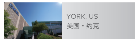
YORK, US 美国·约克