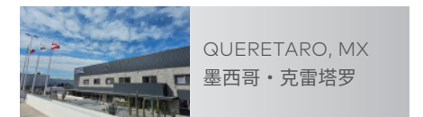
QUERETARO, MX 墨西哥·克雷塔罗