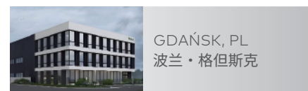
GDAŃSK, PL 波兰·格但斯克