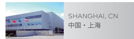
SHANGHAI, CN 中国·上海