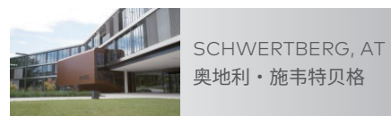
SCHWERTBERG, AT 奥地利·施韦特贝格